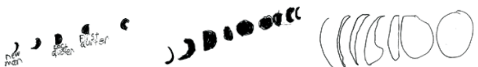
Figure 3. One student's drawings of the cycle of lunar phases: pre-instruction (random order), post-instruction (full cycle), and delayed-post (half-cycle, increasing pattern).