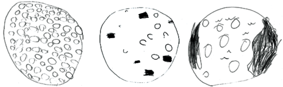
Figure 1. One student's drawings of lunar surface features: pre-instruction (one surface feature), post-instruction (three surface features), and delayed-post (three surface features, one year later).

tures of the moon, the daily apparent motion of the moon, and monthly observations of the moon. Each student was originally only asked questions from two of the three subtopics resulting in 11 students interviewed for each subtopic in the longitudinal study. Interview questions focused on observational features rather than causal explanations (i.e. students were not taught or expected to know the reason for the phases of the moon; instead, they learned the monthly observable pattern).