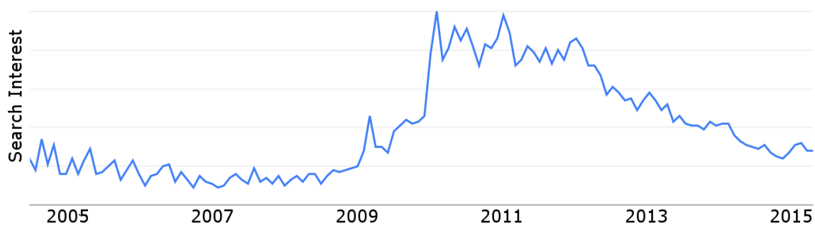
Figure 1. Google Trends results for "Stereoscopic 3D". Vertical-axis is search interest normalized by Google.

That inconsistent pattern of public interest continues today as blockbuster movies such as 2009's Avatar , currently the highest grossing film of all time, reignited tremendous interest which now shows signs of declining. A normalized plot of Google search activity for "stereoscopic 3D" shows interest initially driven by Avatar and then fading (Figure 1). Further evidence suggests that today's resurgence of 3D films may be another fad as sales of 3D film tickets have declined four years in a row in total revenue and seven years in a row in percentage of overall ticket sales (Lieberman, 2014), and sales of stereoscopic home theater systems have fallen below industry expectations (Dash, 2013).